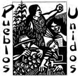
Jalapa, N.S., Nicaragua